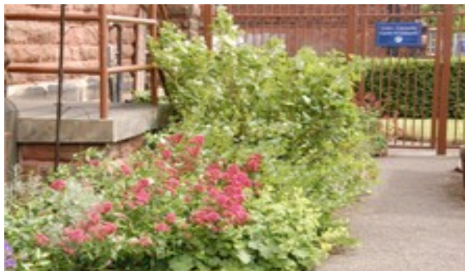
Church side-garden: At start of the Spiritual walk