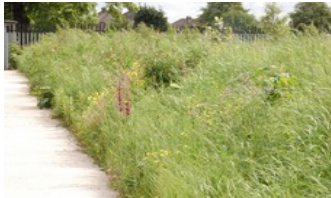
Bulb Bank: Summertime grasses & wildflowers