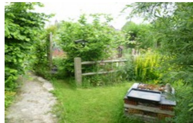
Bug Hotel in Wetland Area

Roots, Shoots & Fruits Cluster Group: penultimate Saturday in the month: 10.00am to 12.30pm. Car Park and Graveyard are open during daylight hours Outside these times: by prior special arrangement only. NOTE: May be closed during Holidays / Inclement weather