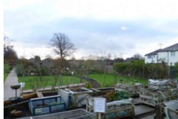
Winter view from Mini-Garden area