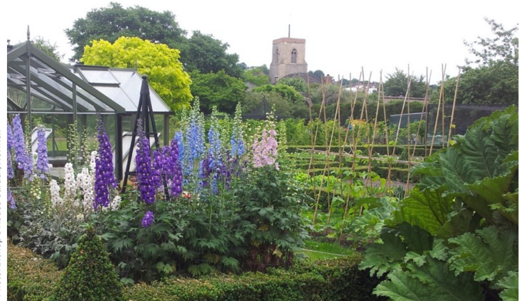
Photo: Bishop's House Garden, Norwich

An invitation to support Quiet Gardens worldwide...