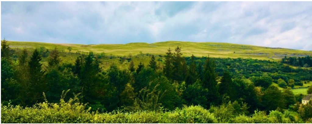
Photo: Scargill House, Yorkshire